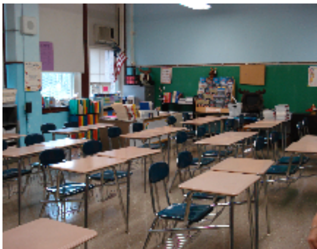
Where are all the neat wooden seats and desks with the ink well holes that WE never used?