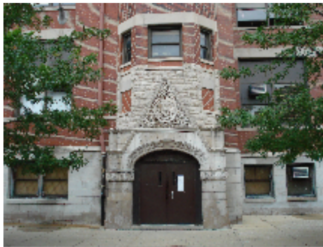
One of Tuley's grandest entrances, today.