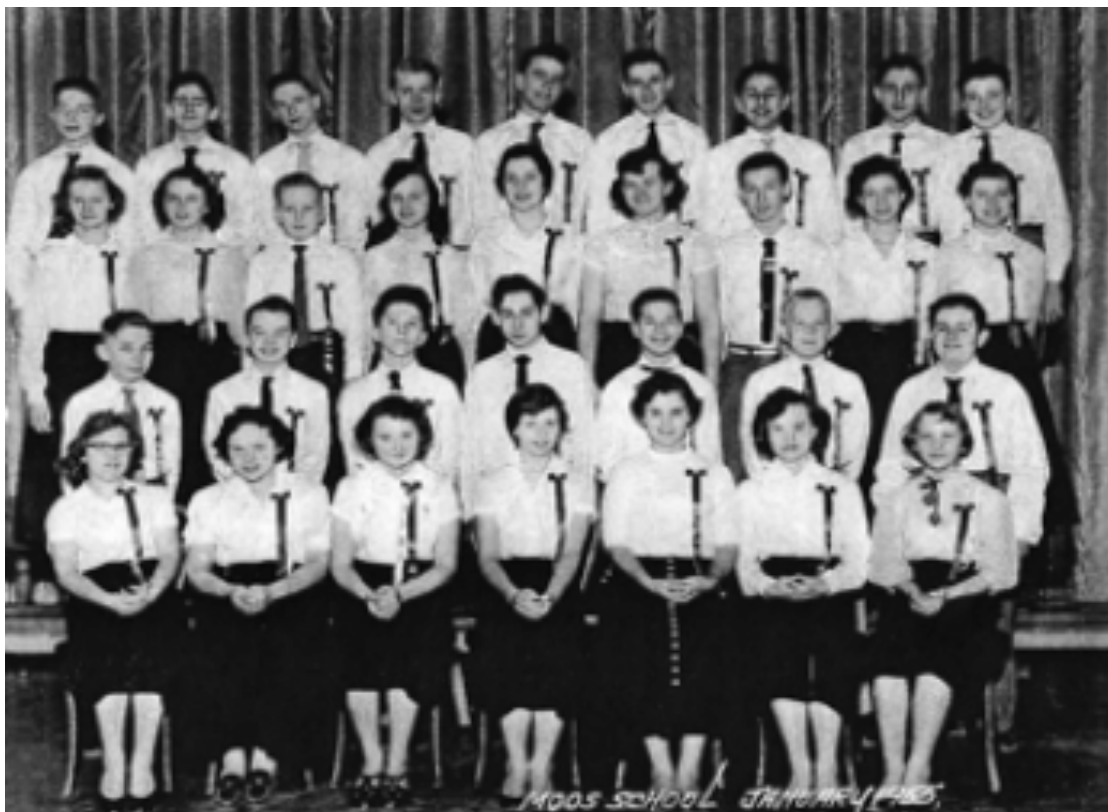
Class of Jan. '55