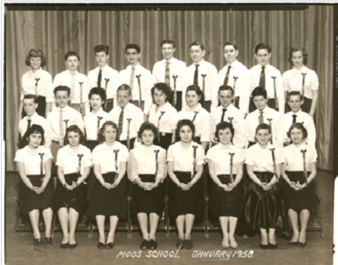
Class of Jan.'58 Graduation Photo