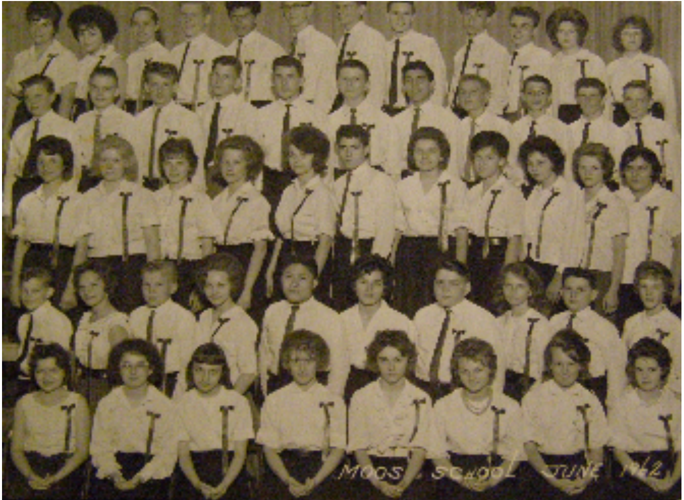
Class of June 1962