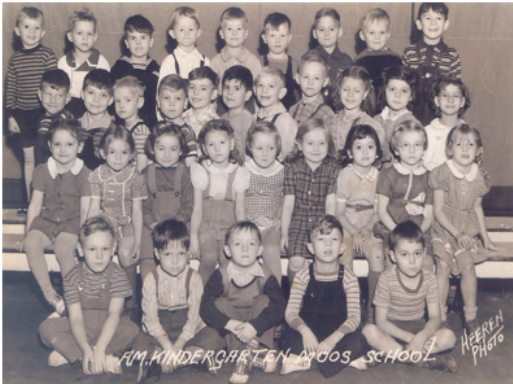
Not sure what class this is but someone out there should recognize some of the kids or themselves. It's an AM kindergarten class and it's undated. My guess is Jan. '51 . I see a few faces that look strangely familiar.