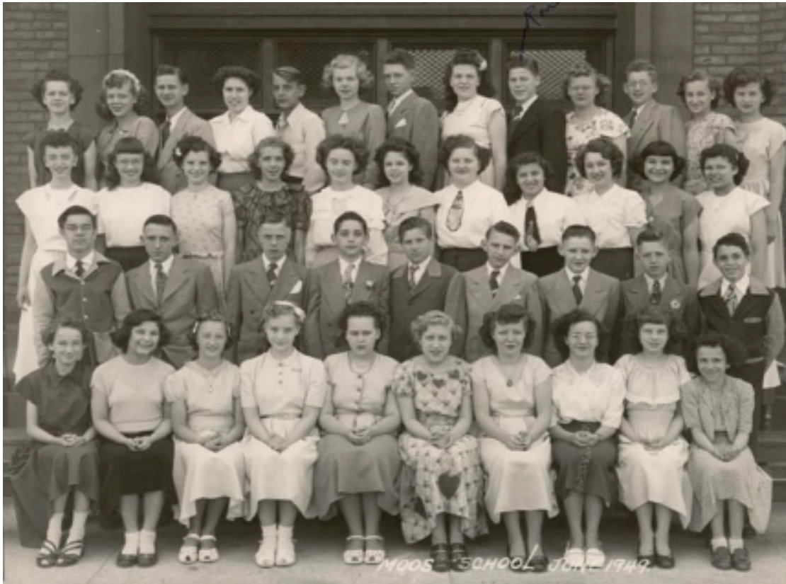
Class of June 1949