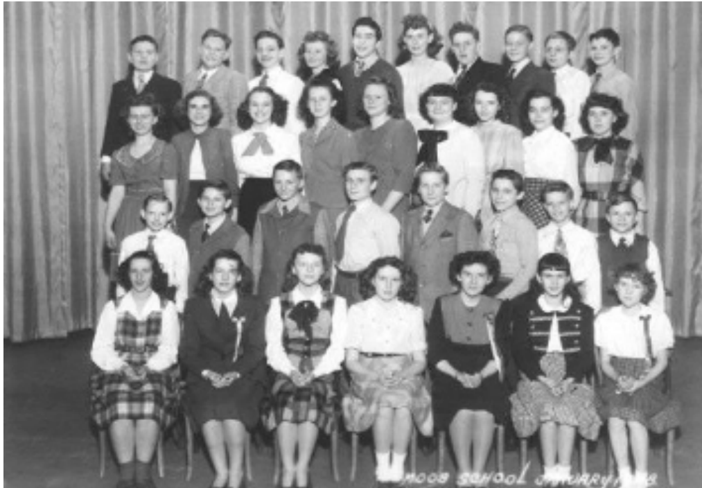
Moos graduating class photo January 1948