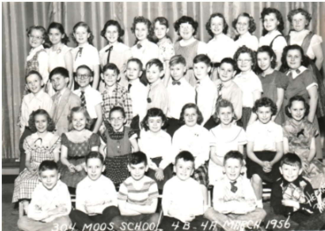
4B-4A Class of 1960