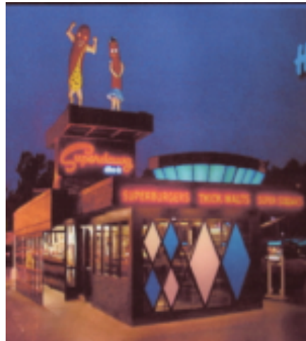
It's dawg vs. dog in a wiener war in U.S. District Court in Chicago.

On Sept. 27th Kiddieland pulled the plug. Located at North Ave. and 1st Ave. only a few blocks from Russell's for Ribs. it was started in the mid-30's it was the place to take our young tykes for a fun afternoon.