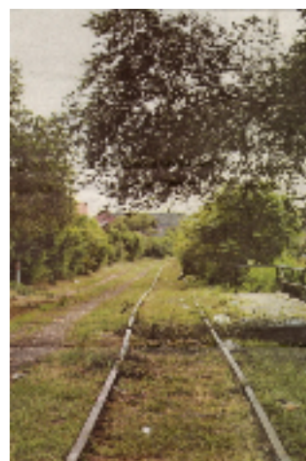
Soon to be Bloomingdale Trail