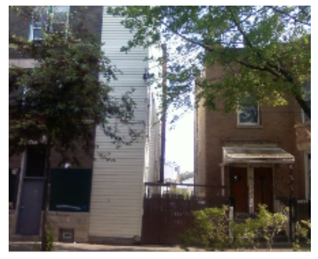
The gangway where Kathy used to play.