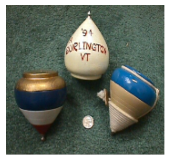
Tops of old Left one shows "advanced" stringing