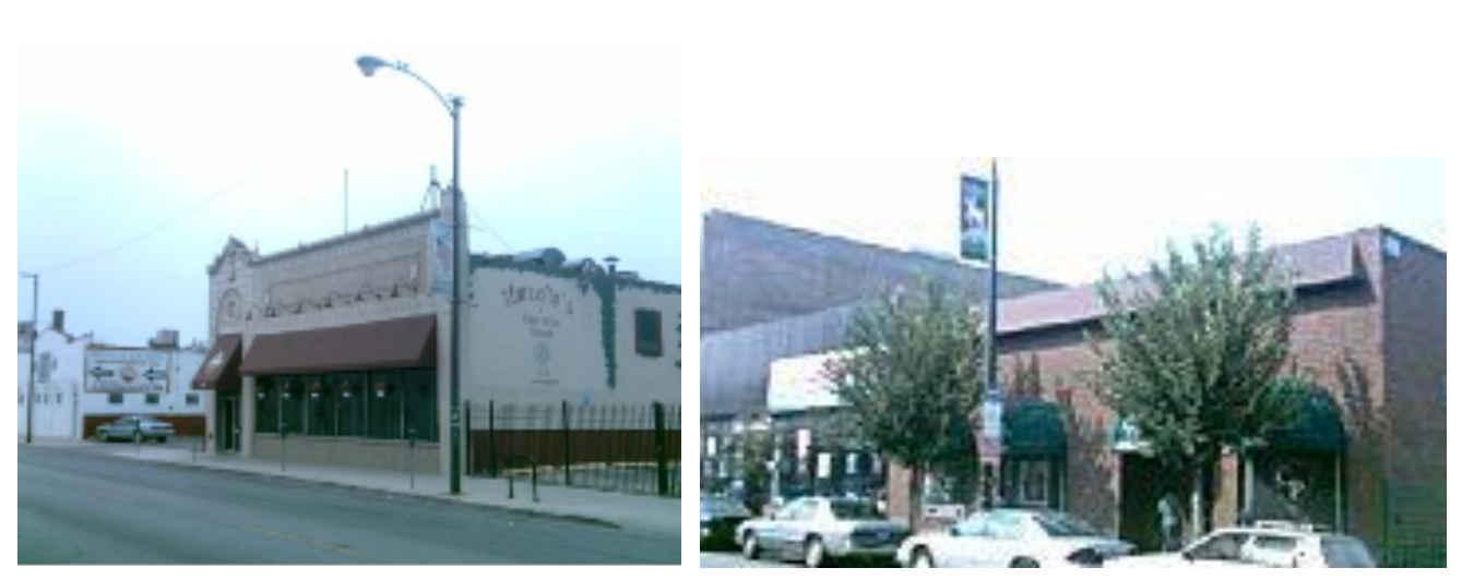
Father and Son Restaurant...Today