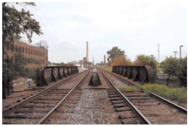
The Forbidden Trail