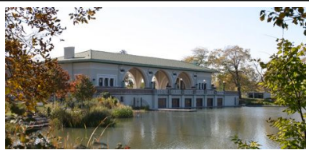
Gorgeous photo of the old boat house in Humboldt Park taken from the island.