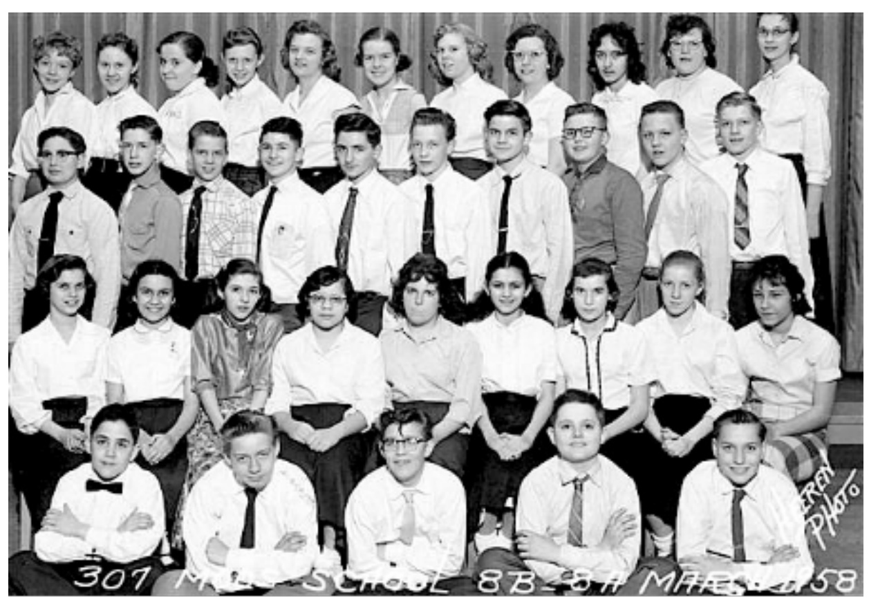
Class of June'58 & Aug.'58 & Jan.'59