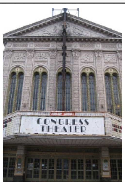
Congress Theater 1987