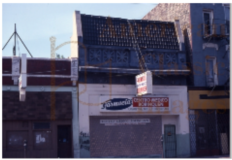
The Queen Theater 1982. After it was converted into a grocery store. Was this the 2nd location of Luigi's restaurant?