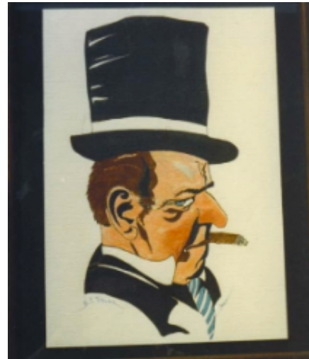
Two vastly different samples of Casey Siewierski's talented artistry