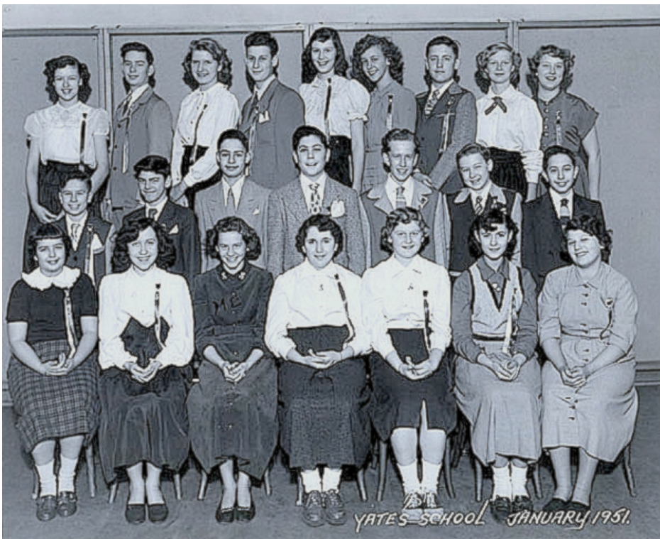
Yates Class of January 1951 Grad Photo Taken on: January 24, 1951